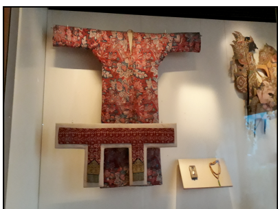
Costume and Sash